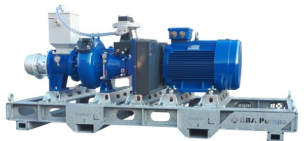
Base frame 12-29