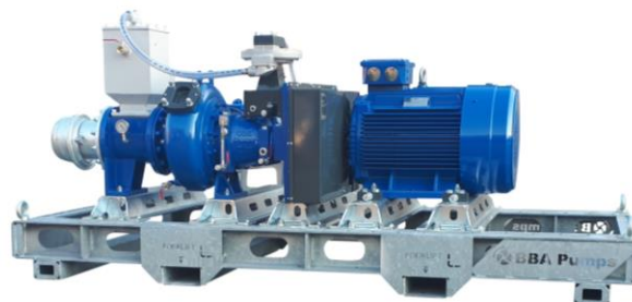
Base frame 12-29